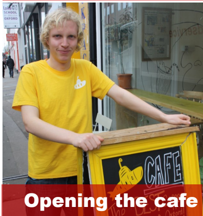
Opening the cafe