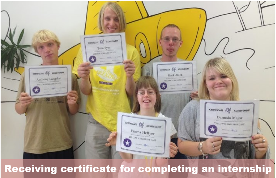
Receiving certificate for completing an internship