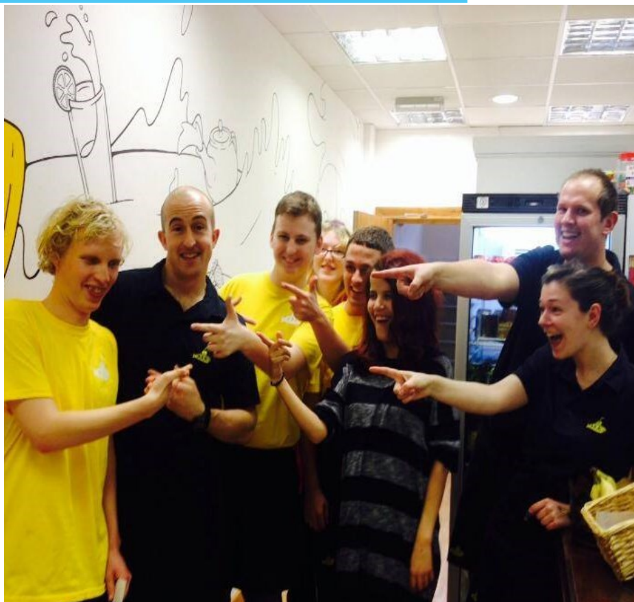
Receiving a Youth Award nomination letter