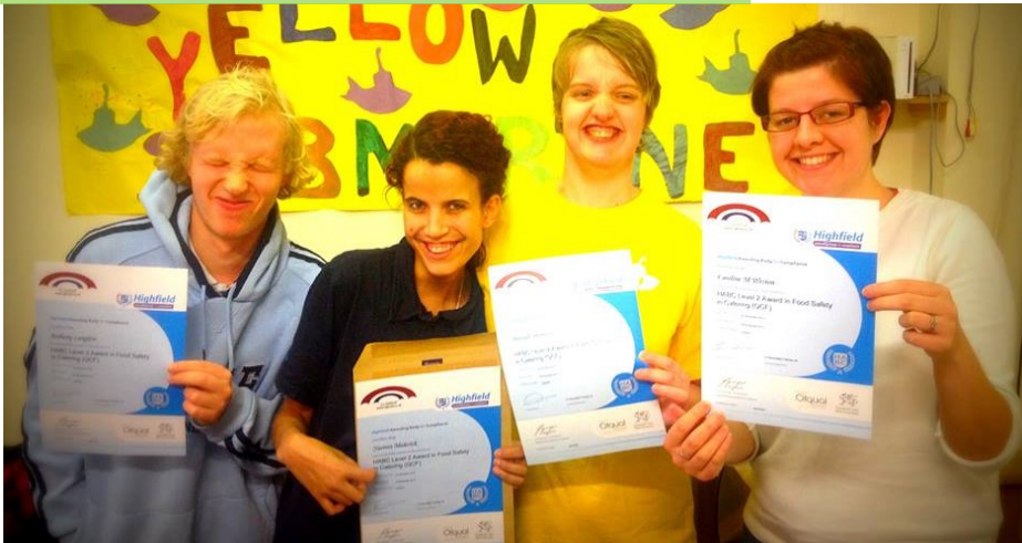
Receiving his Food safety certificate