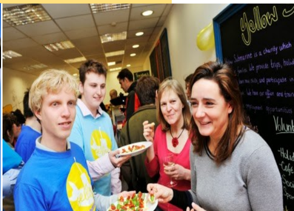
At the opening party