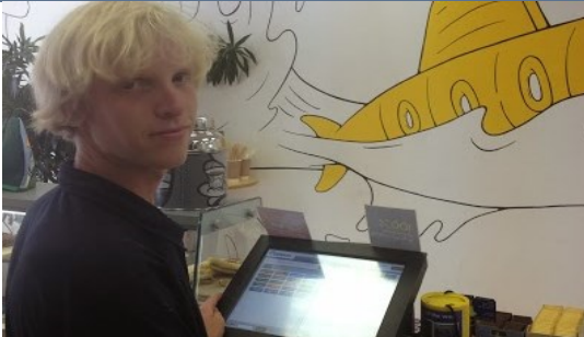
Working on the till