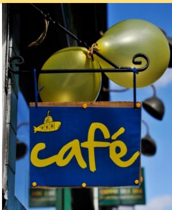
The new cafe