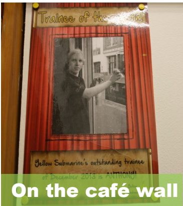
On the café wall