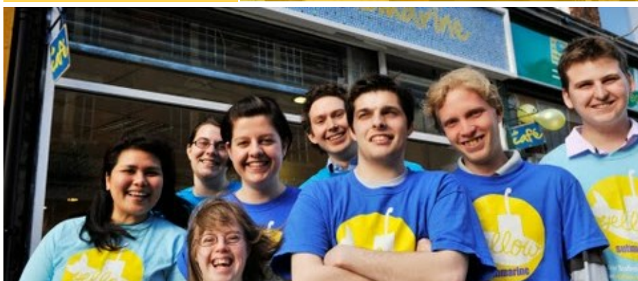
Celebrating with Yellow Submarine members