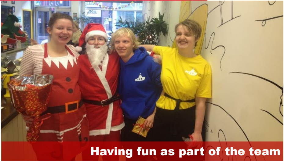
Having fun as part of the team